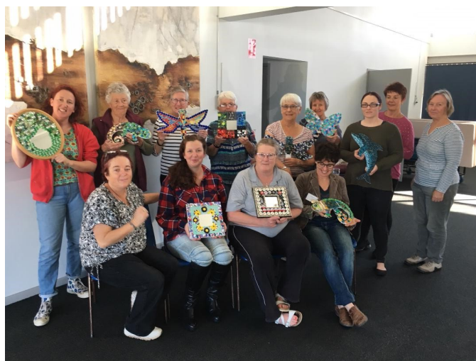
Eager participants at Mosaics Workshop

ton Country Club for their usual high standard of catering. It was a very social weekend for everyone involved.