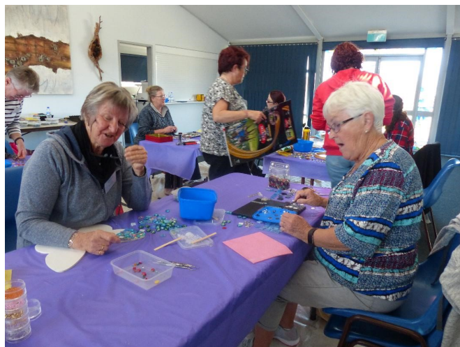
Having a great time at the Mosaics Workshop