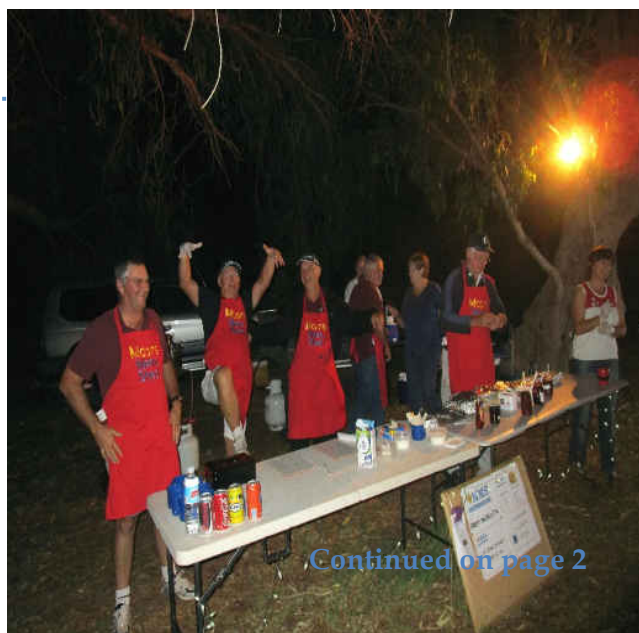
Moore Men's Shed serving damper and billy tea