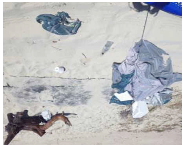
Rubbish left from 4WD Campers on the beach