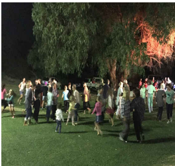
Fun at Bush Music in the Park