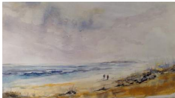
Guilderton Beach Watercolour