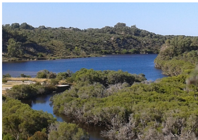
Autumn is a wonderful time in Guilderton