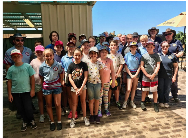
Another Great Bunch of Helpers