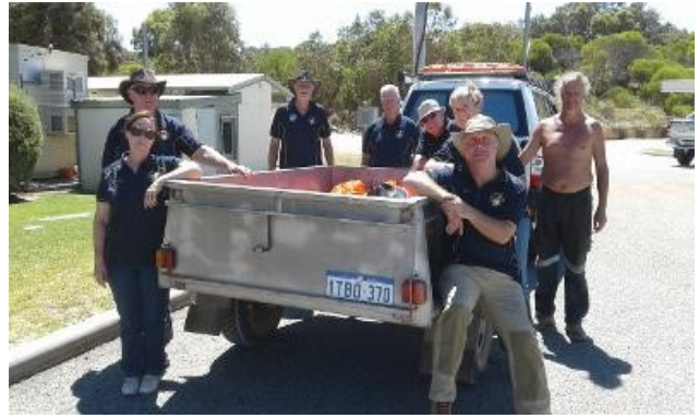
Some of the Workers