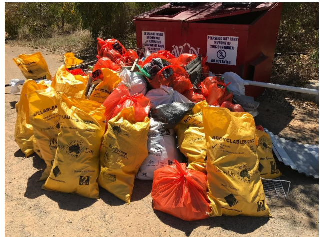
And Some of the Rubbish!

The Easter Art Show was a resounding success with wonderful Artists displaying their work. The day was very pleasant with warm temperature and mild winds blowing. Many locals and visitors enjoyed the day. Displays included pottery, oil painting, water colours, photography, mosaics, jewellery, paper flowers, wood sculpture and grass weaving. We would like to thank the artists, volunteers who help set up and cleared away at the end and others that just leant a hand as need be. Maggie Schmidte did a magnificent job selling raffle tickets—you just could not go past Maggie without succumbing to her laughter and fun on the day—and there were great prizes to be won, donated by the artists of the day. Thank you.