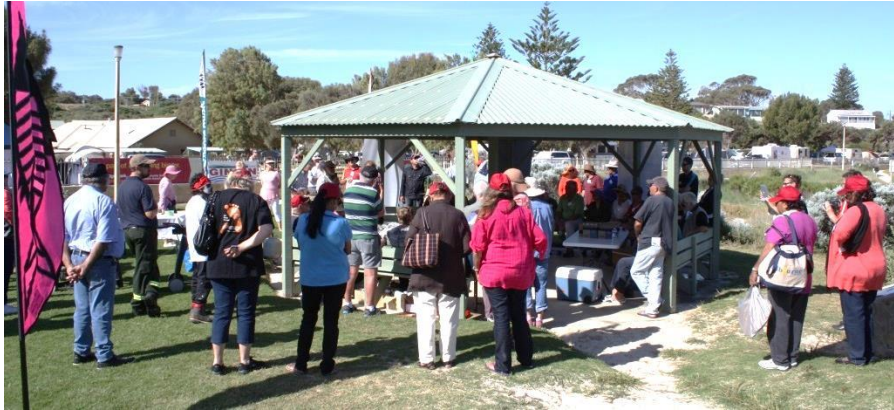
Celebrations at the estuary gazebo