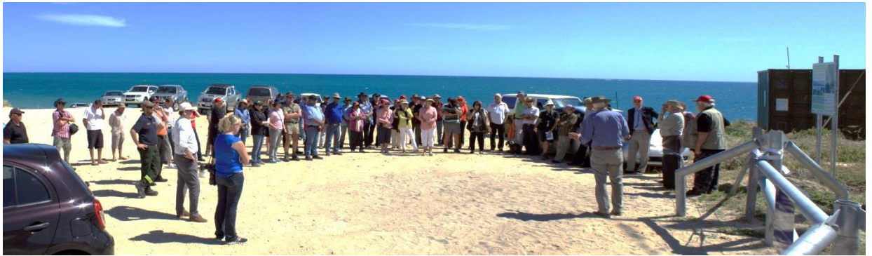
Huge attendance at the opening of Guilderton's Djena Koorl-ing walk trail

Guilderton has always been a special place to many but its wonderful natural assets are becoming more and more threatened from increasing visitor numbers. The Guilderton Celebration Day on Friday 24 th October saw around 80 people from all sectors come together to celebrate three projects that are helping to conserve the fragile dunes and Moore River estuary for the future. The day was organised by the Guilderton Community Association (GCA), Shire of Gingin (SG) and Moore Catchment Council (MCC), and started with the official opening of the Djena Koorl-iny (meaning 'go on foot' in Noongar) walk trail north of town.