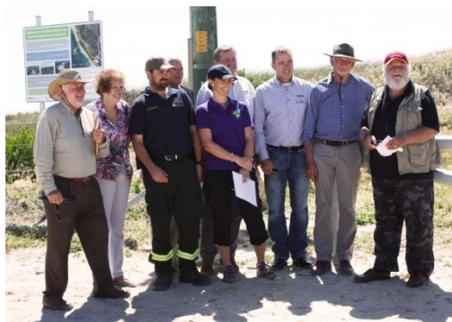
Stakeholders of the North Dune project